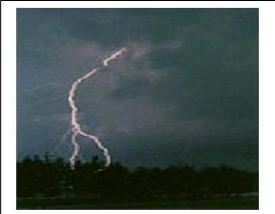
Plate 5.2 Cloud-to-ground lightning is the most damaging and dangerous form of lightning. Although not the most common type, it is the one which is best understood.