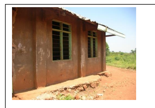
Plate 5.7. Iron sheets destroyed by lightning at Runyanya Primary school.