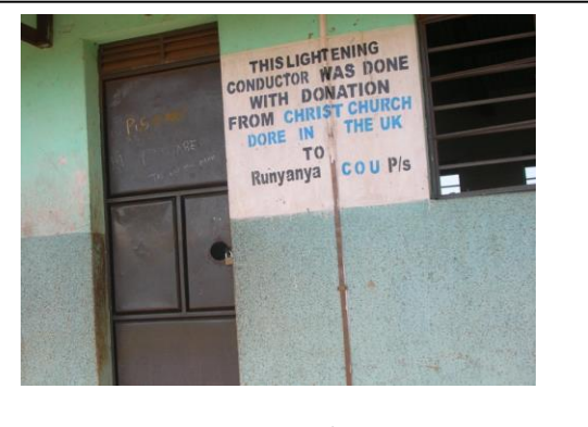
Plate 5.9. The commissioning of the lightning conductors at the school.