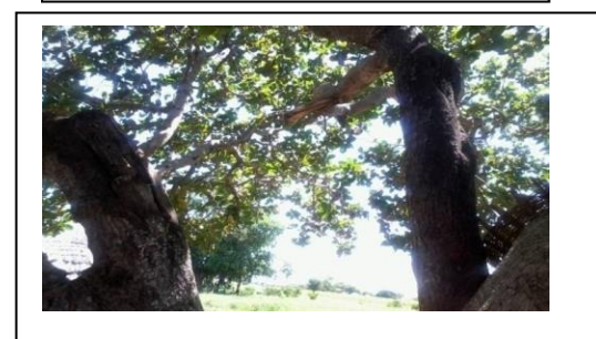
Plate 5.5. A tree that was struck by lightning and killed a cow in 2005 in Kumi.