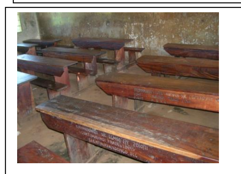
Plate5.6. Classroom where children were killed,