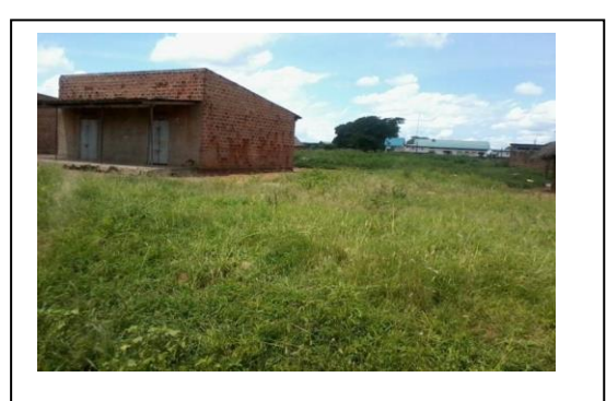
Plate 5.4. Kabarwa Primary school where cows were hit by lightening in Bukedea District.