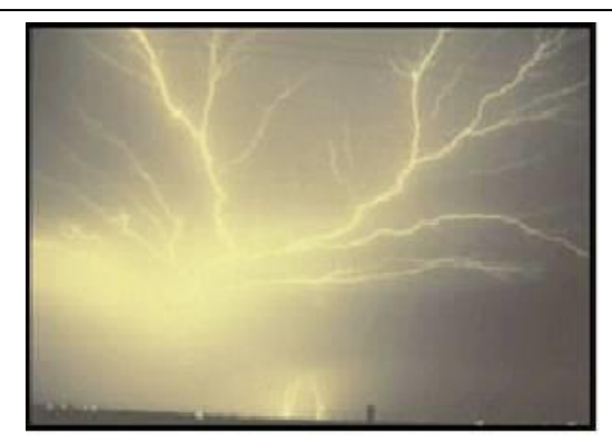
Plate 5.1: Intra-cloud lightning is the most common type of discharge. This occurs between oppositely charged centers within the same cloud.

Some communities in Uganda associate lightning with superstition and witchcraft. However, the science of lightning begins with rain clouds which contain water drops and ice particles. When the water and ice rub on one another they become charged and the top of the cloud becomes positive (+ve) and the bottom negative (-ve). These positive and negative charges get attracted to each other causing lightning between the cloud and cloud (Intra cloud lightning) ( Plate 5.1 ). The negative charges below the cloud create a positive charge in the ground and as these negative charges grow stronger it jumps into the ground causing lightning spark seen during storms. This spark can strike anything that stands high above the ground or mountains ( Plate 5.2 ). These can be people, animals, buildings and trees.