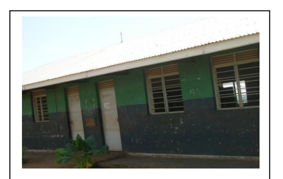
Plate 5.8. Installed lightning conductor at one of the roofs at the school.